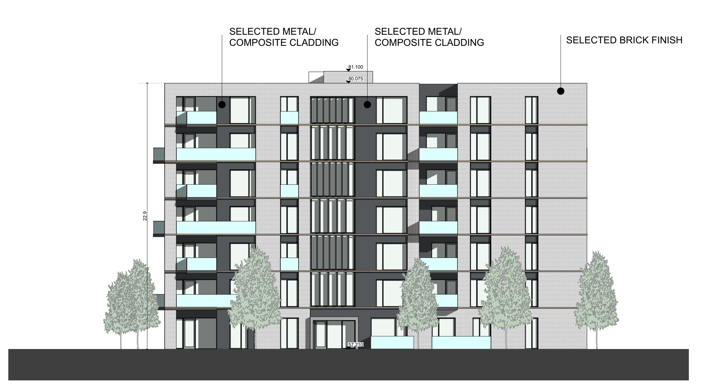
Elevation G-G SCALE: 1:200