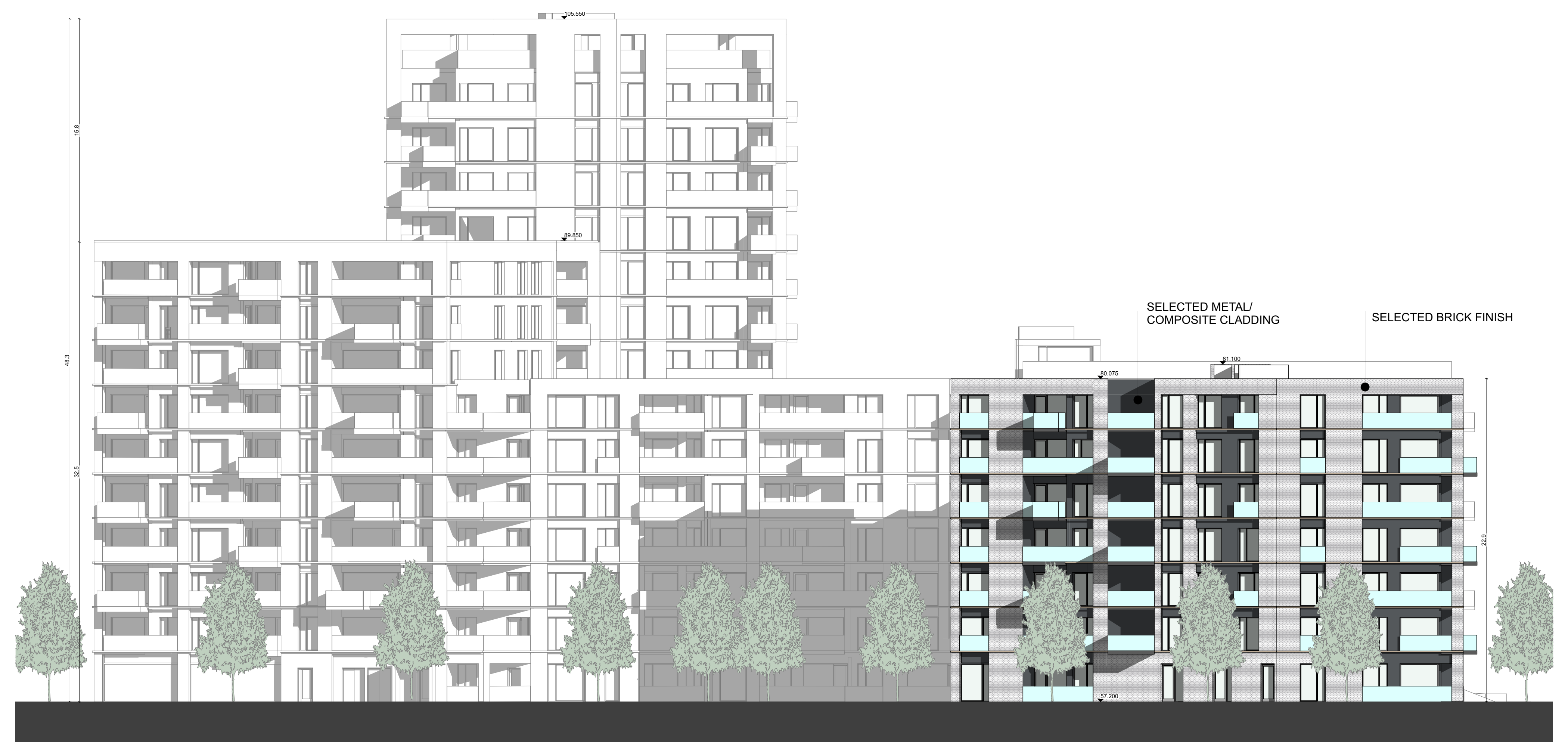
Elevation H-H SCALE: 1:200